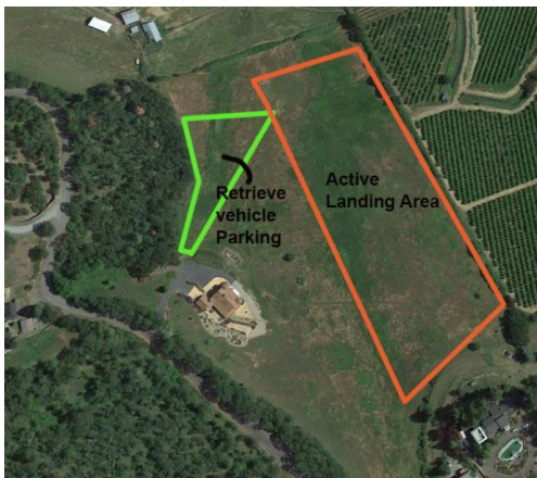
LZ Use areas